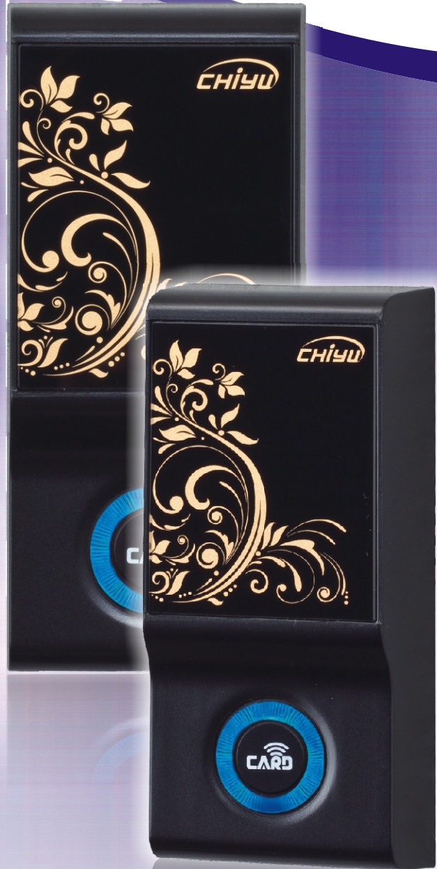
WR-E2/M2 (Black / Silver)