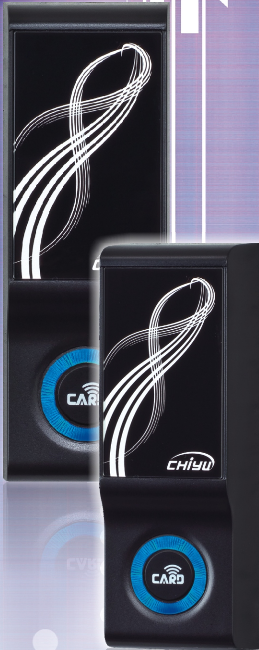
WR-E1/M1 (Black / Silver)