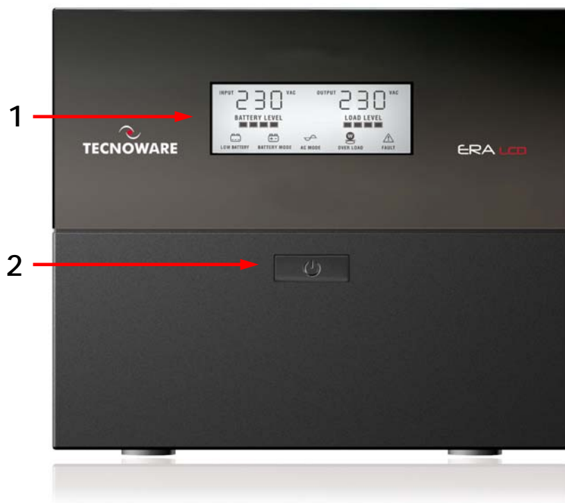
Figure 1 - Front panel